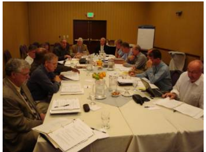
National Executive Committee members discussing agenda items at the June meeting in Denver

The second meeting was held on June 6 th in Westminster, Colorado. This meeting continued discussions on the topics covered during the February meeting, and also included discussions about the relationship between AIPG and the AIPG Foundation. The Executive Committee also heard from a representative of the Geological Society of London, and a representative of AGI.