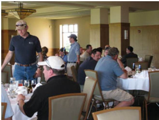
Members enjoying dinner and comparing scores following a day of golf.